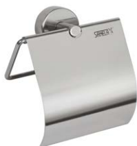
SLZN 09 95090 Stainless steel holder of toilet paper