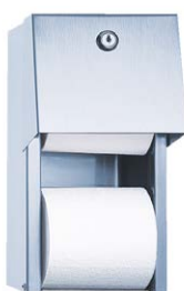
SLZN 26 95260 Stainless steel holder of toilet paper