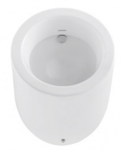
SLP 82 - WCA - Sanindusa