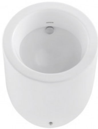
SLP 82 - WCA - Sanindusa