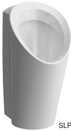
SLP 59 - LEMA